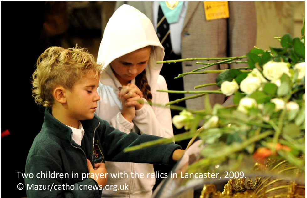
Two children in prayer with the relics in Lancaster, 2009.